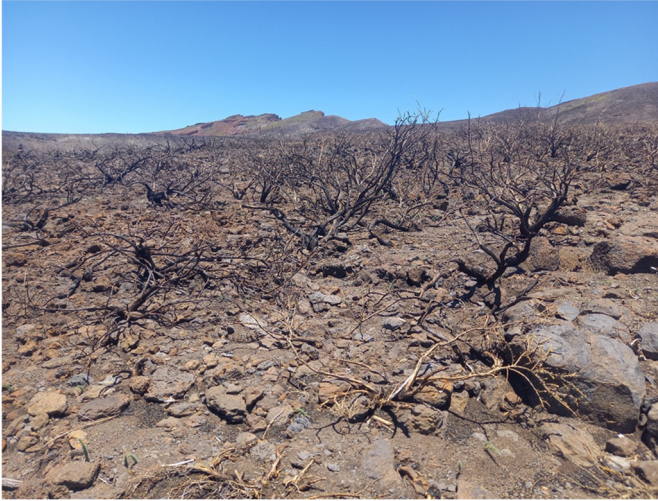
Figure 3: Burned summit scrub in La Palma 10 months after the 2023 fire. Notice the absence of plant regeneration.

late the investment of fat into follicles (BLACKBURN, 1998), and to finally induce variation in the reproduction output (SANTOS & LLORENTE, 2004). This could be the case for females of G. galloti in the burned areas from La Palma. The apparent scarcity of plant resources observed in the burned areas poses an uncertain fate for the medium-term viability of these omnivorous lizard populations.