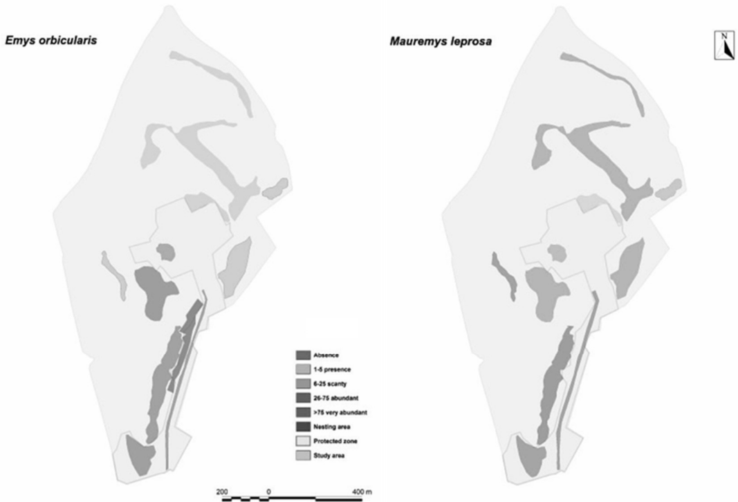
Figure 3: Maps of species abundance according to the number of captures per pond. Suggested nesting area for Emys orbicularis is also represented. For a correct visualization of the colours indicating abundance levels, consult the online version of the paper.

on the shores of the ponds surrounding this area where radio-tracked females were found supports its identification as nesting area (Fig. 3).